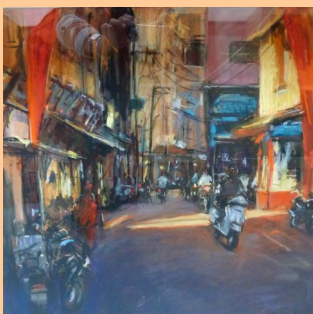
Festival Colour Udaipur

By the way, due to popular demand Roger will be doing another workshop. If you register your interest now you will be contacted first. Wednesday 16th October.